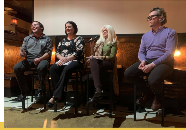
NAMI panel after screening of "Joker" at Film Grain Dinner & Movie at the Bourbon Barrel